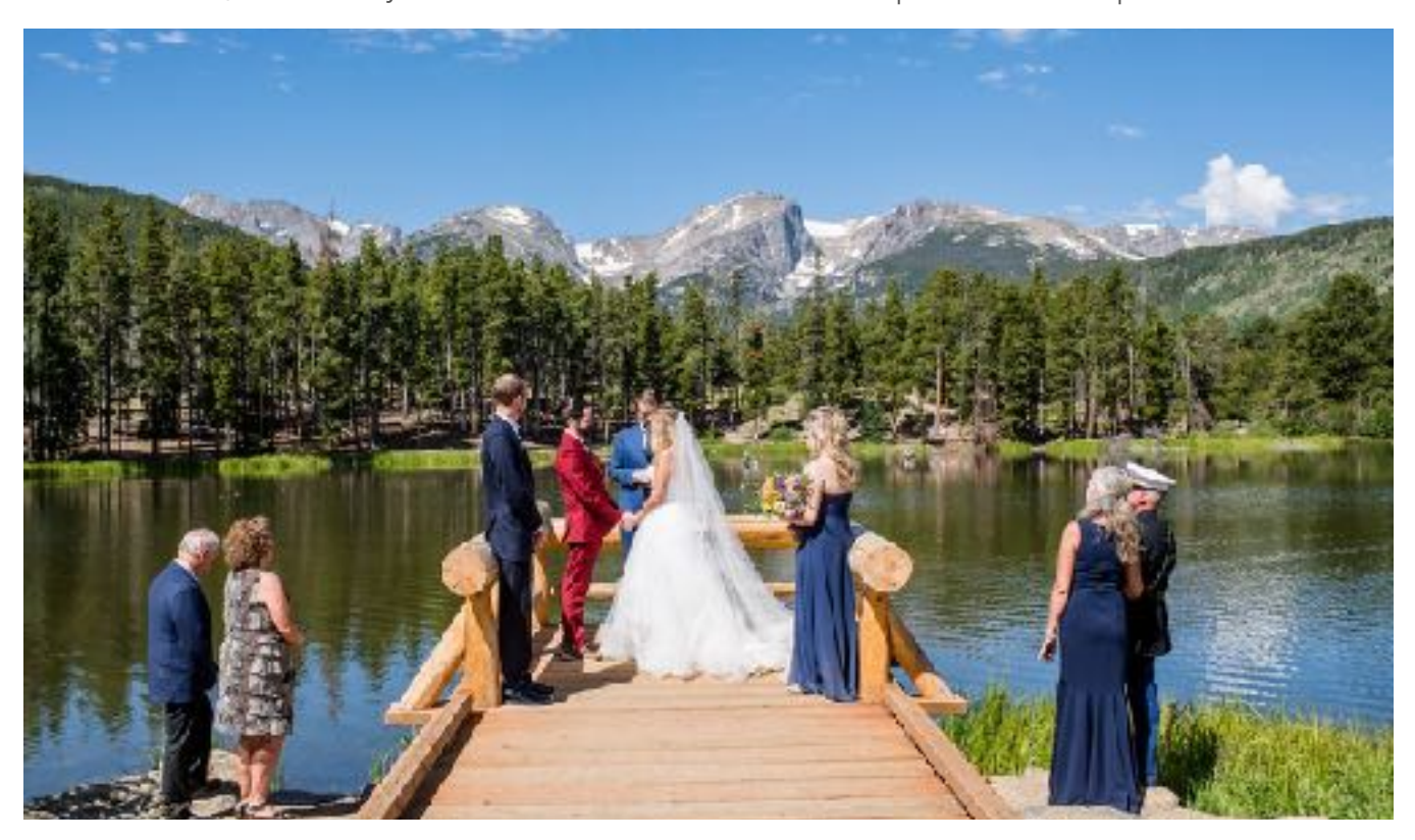
July 2020 near Rocky Mountain National Park, Colorado

I often get asked that question. And, it's an easy, simple answer. July. Okay, that is my opinion, but here is why I think that. First, it's my birth month. But seriously, the days are warm, it is peak wildflower season, the trails are accessible (hiking, mountain biking), and it is likely before wildfire season (usually August) hits. Of course, we've had years in which the snowfall was so deep the ski season prior we were STILL