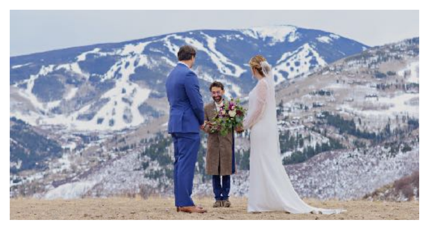
December 2020 near Beaver Creek, Colorado

One of the most most frequently asked questions I get is.... what is the weather like in Colorado? And let me tell you - its not that easy to answer! Colorado weather varies GREATLY depending on the month, yearly cycles, and regions. I've lived in Colorado for over 25 years (born, raised and educated in humid lowa), and each year seems to be different. We can be wearing T-shirts in February and snow gear in September, Memorial Weekend! Seriously. This past year (2020) we had a 60-degree drop in temperature over Memorial Weekend that threatened our shrubs, bushes and trees. Our weather can be fickle day-by-day, and at the same time there are trends in our weather. So, I created this guide to help you figure out Colorado weather by month, year-round, average temperatures, and regions.