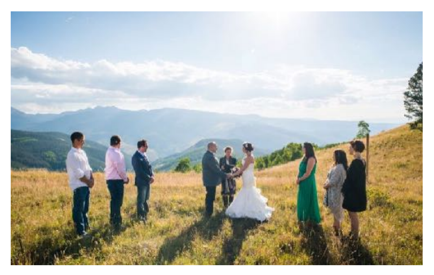
September elopement style ceremony Vail Mountain, Colorado

If you've never been to Colorado and plan to fly into Denver International Airport (DIA), please know that DIA is really located on our Eastern Plains - about 40 minutes EAST of Denver. So, no - DIA is actually not very close to downtown Denver. We occasionally get the request to have a scenic mountain ceremony site no more than 1-hour from DIA. Well, that will put you in the Foothills, like Golden, Colorado which is my favorite place along the Front Range, but not necessarily the dramatic scenic mouton views the most our couples desire. Please do know though, that Colorado services MANY tourists and we are accustomed to the world traveler. From DIA, if you hop onto Interstate-70 and drive West, in an hour and